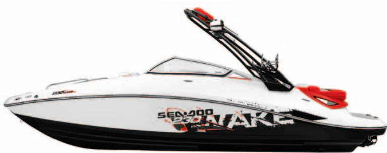
White & Black with Red accent