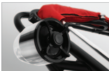
NEW tower speakers