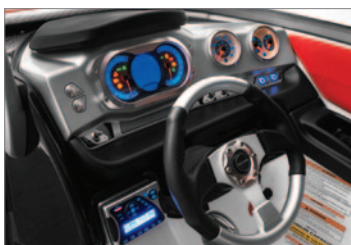
NEW Premium dashboard with Ski mode