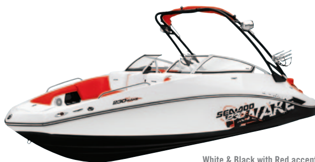
White & Black with Red accent